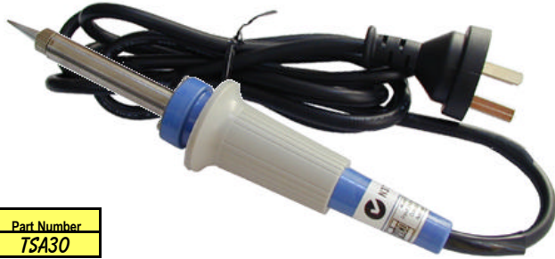
Part Number TSA30

High quality 240V AC mains powered soldering iron with a long life Nichrome element. Fitted with an approved flexible 1.8m cord. Rated at 30 watts, the iron has fast warm up times and is supplied with a long life metal clad tip. Temperature rating of 330°C - Approved to AS3114-1993. - Replacement tips available: RT301, RT302