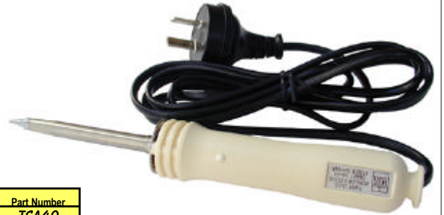
Part Number TSA40

Dual wattage high quality 240V AC mains powered soldering iron with a long life. Ceramic element. Fitted with an approved flexible 1.8m cord. Rated at 40 watts and when button is depressed the wattage quickly increases to a powerful 80 watts. Temperature rating of 330 - 420°C - Approved to AS3114-1993. - Replacement tips available: RT401, RT402