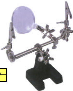
Part Number TSA4

Printed circuit board or solder job holder with cast iron base. This model is supplied with a magnifying glass to help on those really small soldering jobs. Weighted diecast base. Full 360° swivel action and sturdy alligator clips hold the job in place.