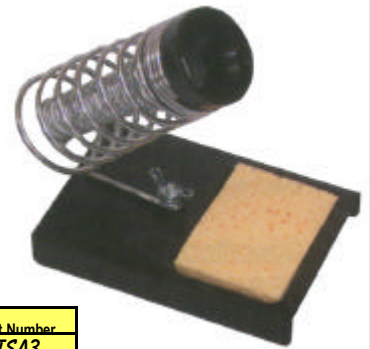
Part Number TSA3

Soldering iron stand with strong coil designed to hold most different brands of soldering irons. - Large metal base aids stability. - Supplied complete with sponge cleaning pad.