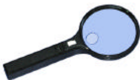
Part Number A0960

Ever tried to locate a broken PCB track or identify those minuscule numbers on semiconductors and acquired a permanent squint in the process? This magnifying glass will take the eyestrain out of tech work. It features a built-in light and a double magnification lens section.